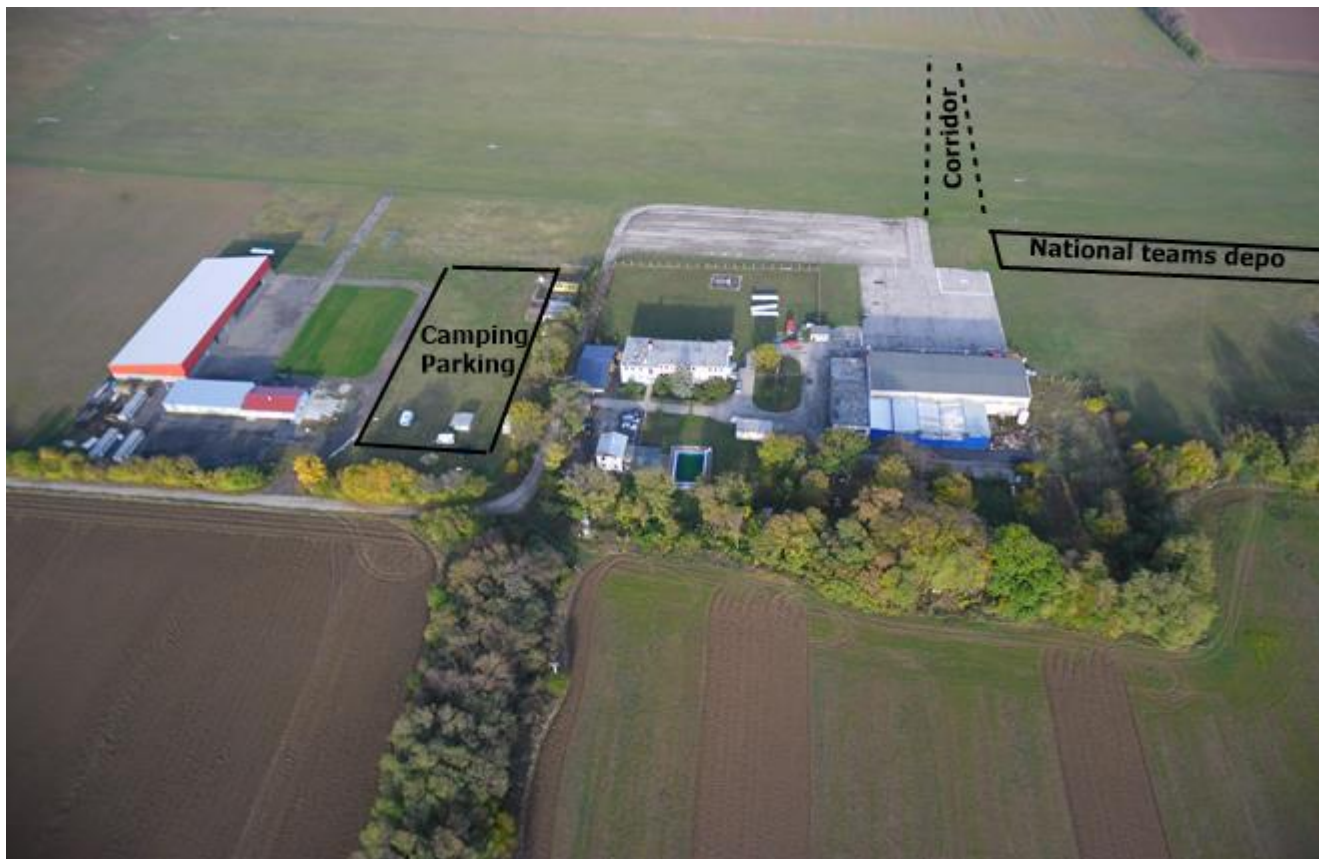
Airport layout World Championships Boleráz - Trnava 2019